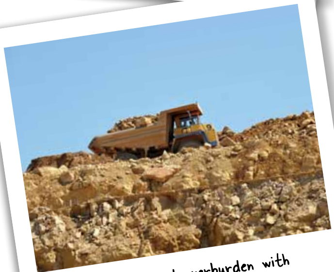
Extracting ore and overburden with precision and efficiency

Our specialised team will focus on expanding your production capabilities using a modern well maintained fleet of 85 tonne trucks and 100 tonne diggers to move what you want, when you want, where you want with precision, efficiency and safety.