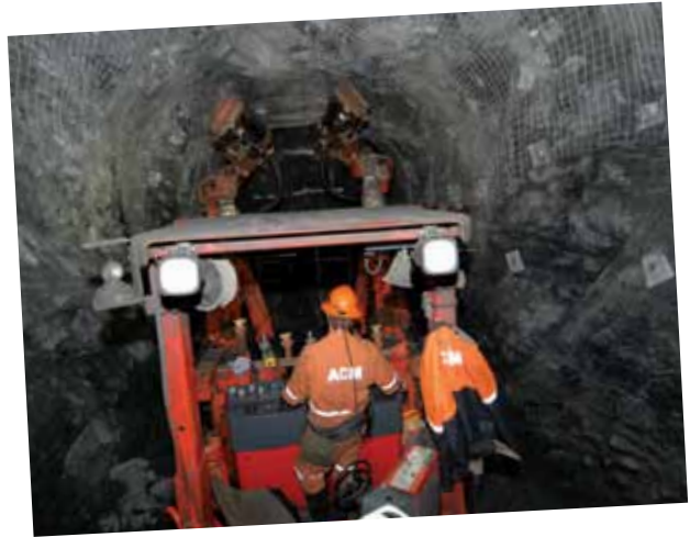
Experienced high speed mine development contractors

Our team's are some of the most experienced operators underground. They understand the importance of maintaining an efficient work schedule and delivering on time and on budget. Our capabilities include all underground gold and base metals mines, from large-scale ore bodies to narrow vein lodes that require specialised mining techniques.