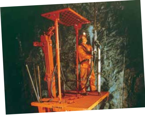
Increasing vertical development productivity underground

Our highly specialised Alimak methods developed over 30 years provide the ability to install ground support and the grouting of water inflows as the raise is being excavated. This ensures raises can be developed successfully through any rock type, even in highly stressed or poor ground conditions.