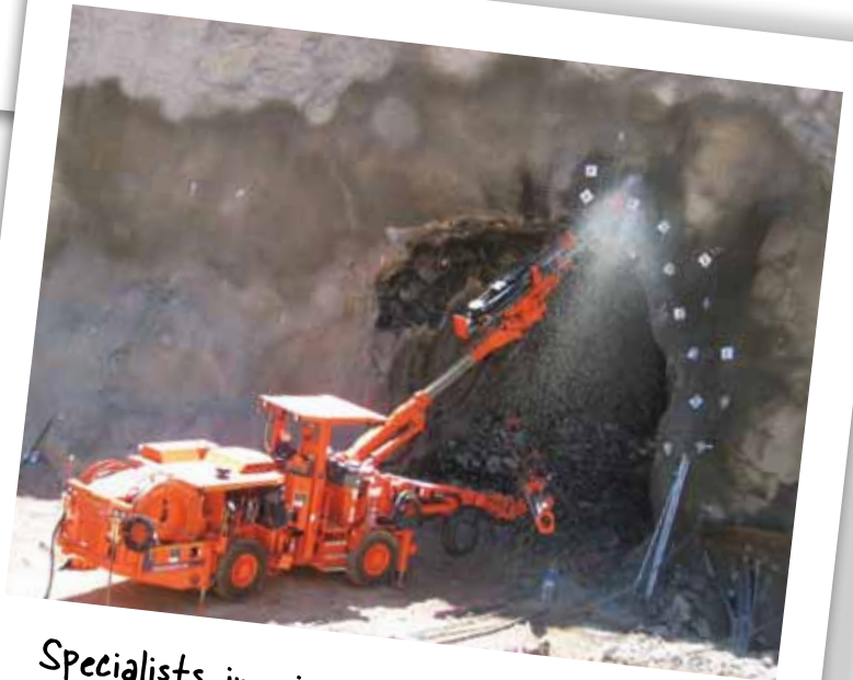
Specialists in mine rehabilitation declines or shafts

The margins can be tight, and the challenges can be great. Whether it's rehabilitating a decline, or refurbishing a deep shaft, ACM have the equipment, personnel and the know-how to ensure your project is completed no matter how demanding.