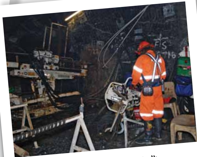
Underground exploration drilling in any terrain in any direction

From short hole localised ore definition drilling to deeper large-scale exploration programs, we have a rig for every job. Our drilling crews operate safely and have the expertise to deliver your exploration programme on time and on budget.