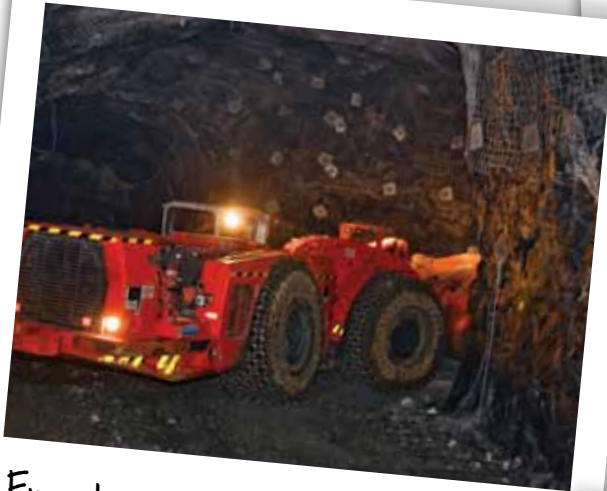
From large-scale massive ore bodies to narrow vein lodes