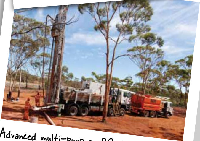
Advanced multi-purpose RC diamond drill rigs for all your drilling requirements

This rig is a low profile raise drill, making it ideal for down reaming and up-hole box hole boring and conventional Raise Boring. This machine is capable of a 600m long by 1.5m diameter raise-bored hole, and is suitable for all slot raises and escapeway systems of between 1 - 2m in diameter.