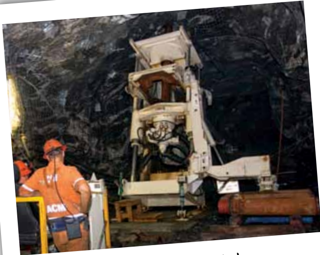
Unique ability to drill box holes or 1.8m diameter, raise-bored holes